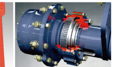
Rear axle braking strong with hydraulic pressure. Advantages: the convenient operation, stable braking and less tire wear.