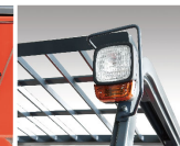
LED signal (standard configuration)