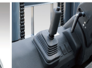
Ratchet type parking brake