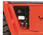
Independent integrated electric cabinet

> Key parts like frame and mast apply CAE top-down design to improve their strength and make the truck tough.